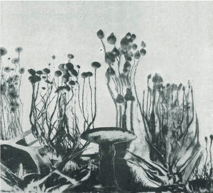
Figure 2. Osmotic productions. Frontispiece in Leduc's The Mechanism of Life.

Indeed, by employing a variety of metallic salts and alkaline silicates (e.g., ferrocyanide of copper, potash, and sodium phosphate), and adjusting their proportions and the stage of “growth” at which they were added, Leduc was able to produce many truly spectacular effects – inorganic structures exhibiting a quite dramatic similitude to the growth and form of ordinary vegetable and marine life. (Figure 2)